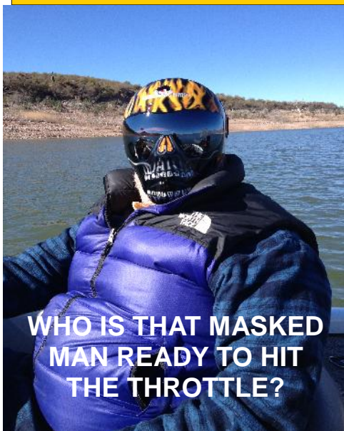
WHO IS THAT MASKED MAN READY TO HIT THE THROTTLE?