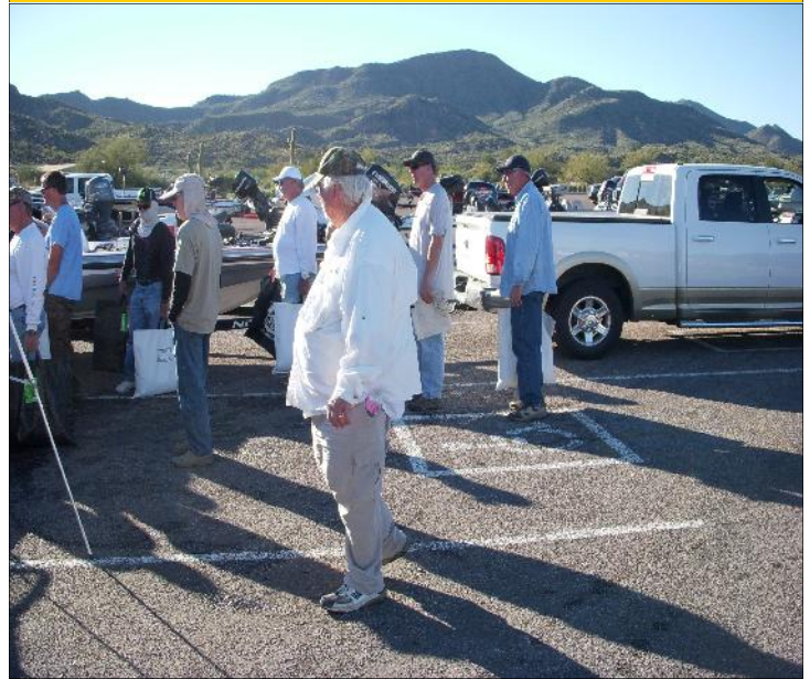
Photo Scrapbook - Lake Bartlett January 15, 2014

Finally, I want to thank each of you for camaraderie, good conduct, and sportsmanship during the Bartlett tournament. During our weigh in we had several on lookers watching the weigh in and asking questions of members. I am positive they left the weigh in with a very positive attitude of bass tournament fishing, our members and club. This goes a long way in overcoming those who do not want us to fish at all!