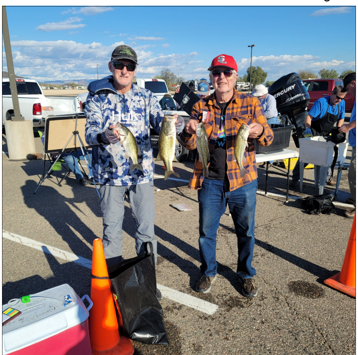
6th Place Grier & Durben

We decided on game day to start on the points where I got the bites Tuesday. We fished the 2 points for a couple hours and caught 3 fish. We moved to a hump where Mark caught a fish on Monday and picked up one there. We checked 3 or 4 other spots with similar structure but didn't get any bites. We went back to the