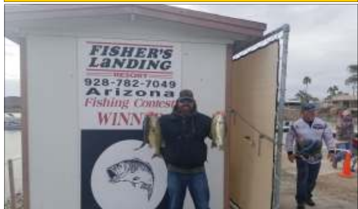
Photo Scrapbook - Lake Martinez - February 20, 2019