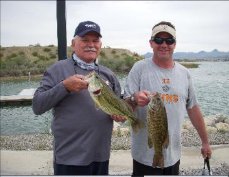
Photo Scrapbook - Lake Havasu - March 20, 2013

Looking forward to seeing you all at our next club meeting and for sure at Alamo!