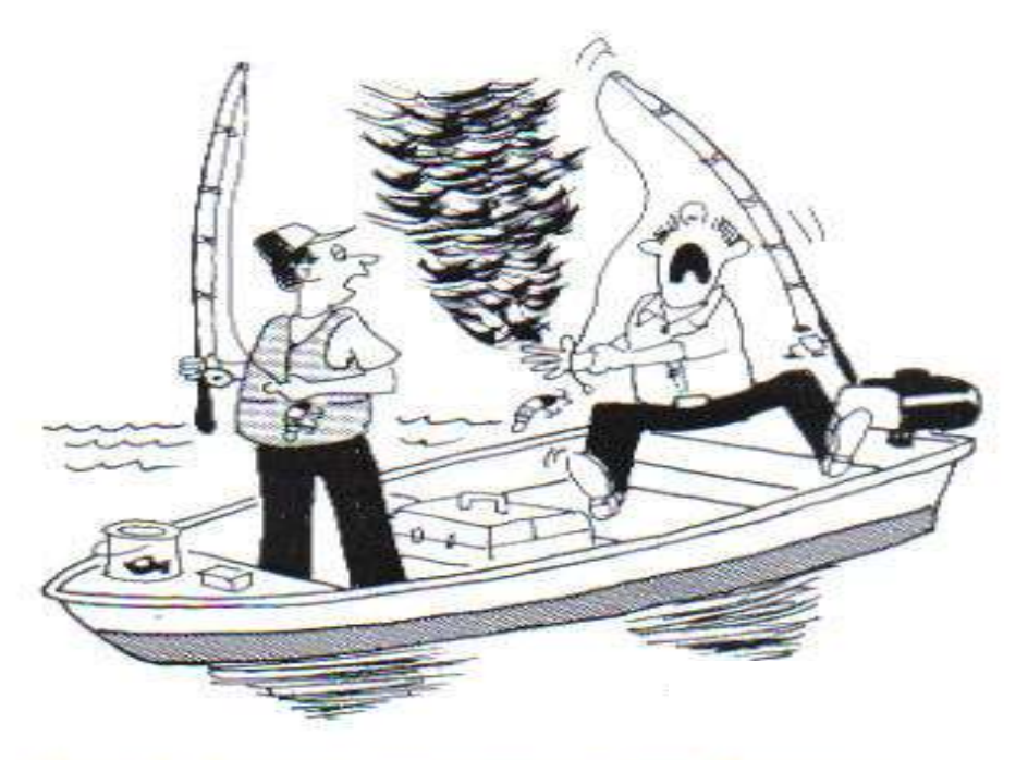
"I told you it was the hottest plug out"

power poles we used an anchor out the back of the boat to keep us in position to work this largemouth. We threw everything at her for about 45 minutes until she finally took my bait. Then the fun began. When I set the hook she made