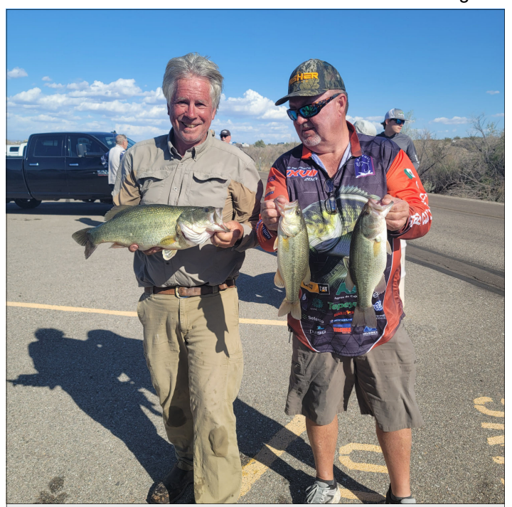
7th Place Duel & Grimes