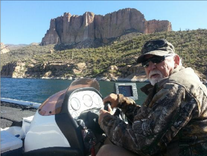
Photo Scrapbook - Lake Apache - April 15 & 16, 2014