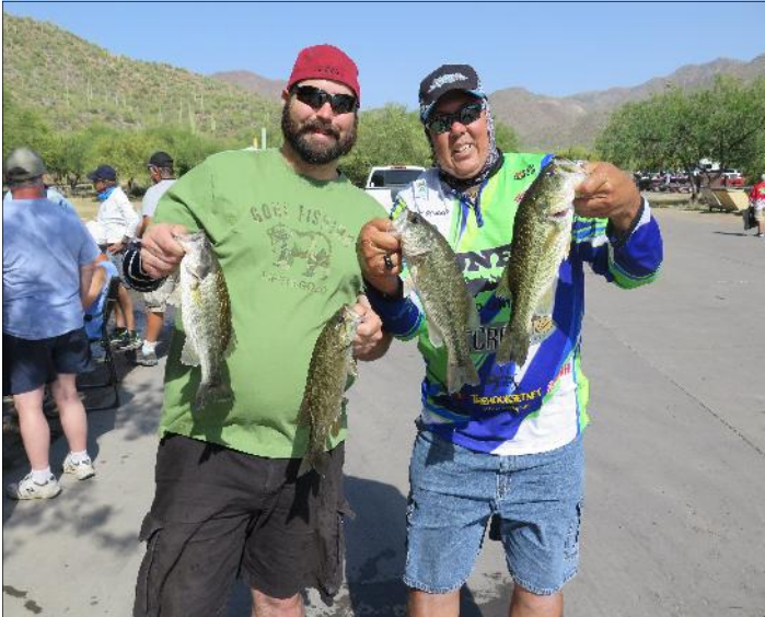
Photo Scrapbook - Lake Apache - April 15, 2015