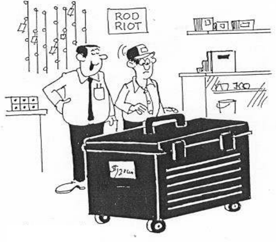
"One good thing about this tackle box is you can get in it if it rains."

As of April 20, 2018 the Midweek Bass Anglers of Arizona consists of 96 dues paid active members.