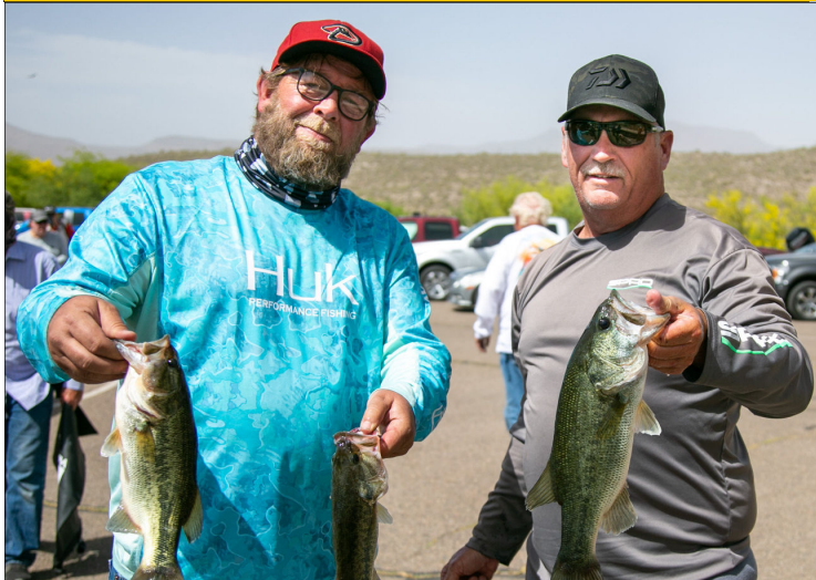
Photo Scrapbook - Lake Roosevelt - April 21, 2021