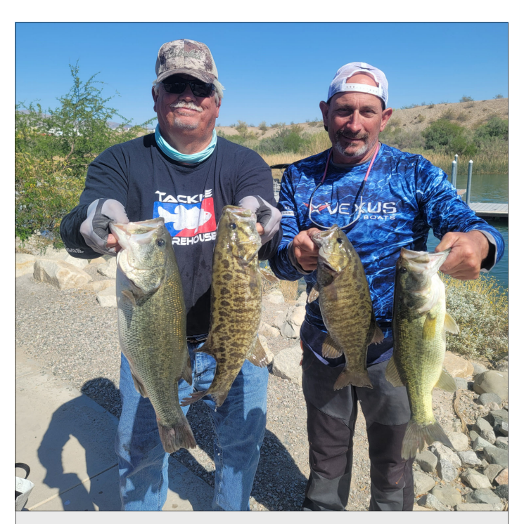
2nd Place Brewer & Stone

south side of the big island where we finished out our limit by 9:30 with smallies on jigs in 15-30 feet of water. We spent the rest of the day down lake, where we culled another five fish throwing Osprey swimbaits and drop shotting. Jeff and I had a good day and I really enjoyed fishing with him, plus the weather was spectacular.