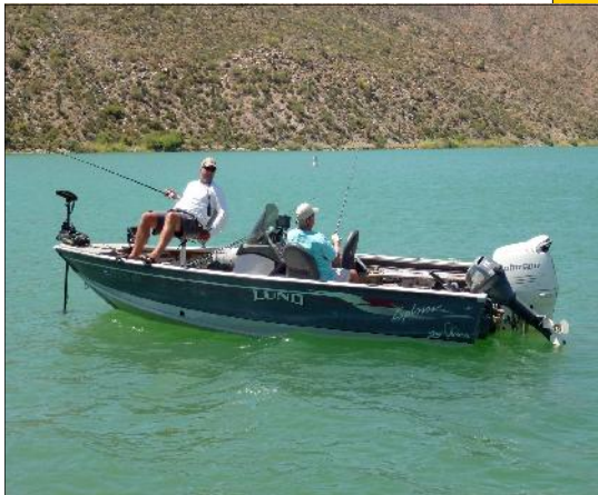
Photo Scrapbook Lake Apache - May 14-15, 2013

schedule. As an example the long range forecast for water in Alamo shows the lake has the potential to reach an all-time low for stored water. Do the members want to schedule it twice with so little water? What I plan on doing is covering each lake's pluses and minuses with the best information we can obtain. Also do the members want another two day tournament and if so where and when. I would like to also hear from the members what they are thinking about how to make 2014 a great fishing adventure for the club.