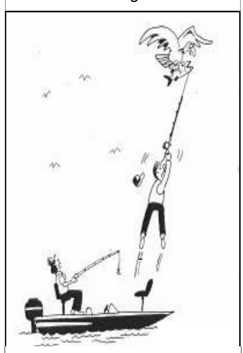
"My goodness Dick-let him have the fish.