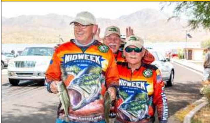
Photo Scrapbook - Lake Bartlett - May 15, 2019