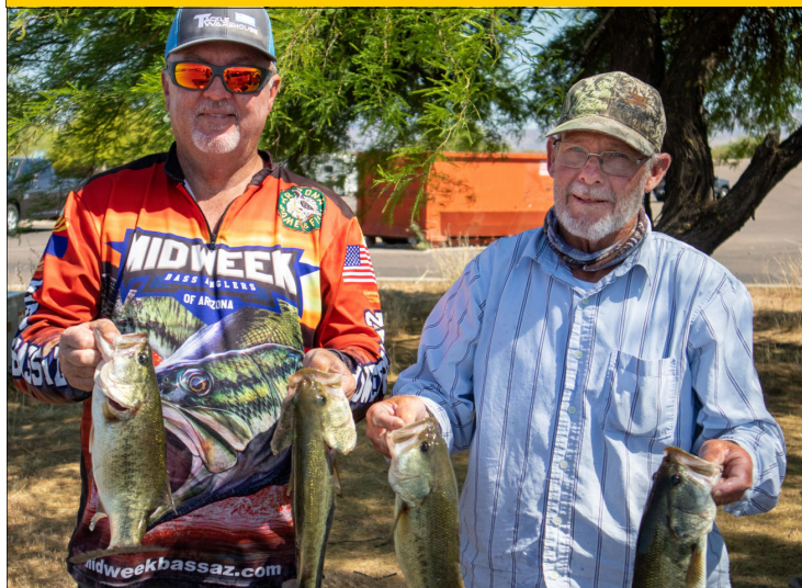
Photo Scrapbook - Lake Roosevelt - May 19, 2021