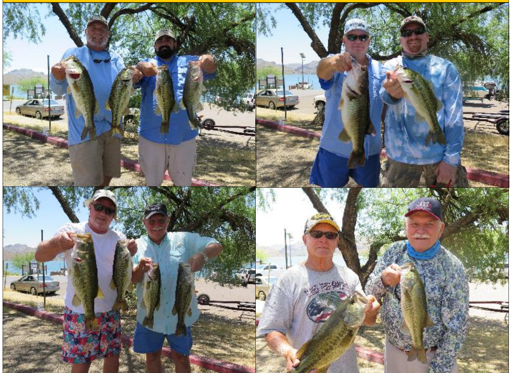
Photo Scrapbook - Lake Saguaro - June 18, 2014