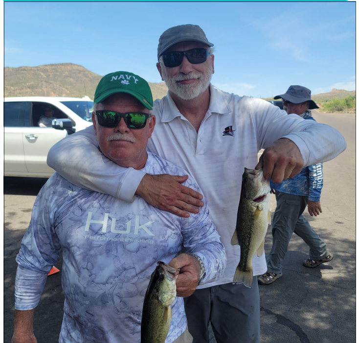
Photo Scrapbook - Lake Bartlett - July 20, 2022