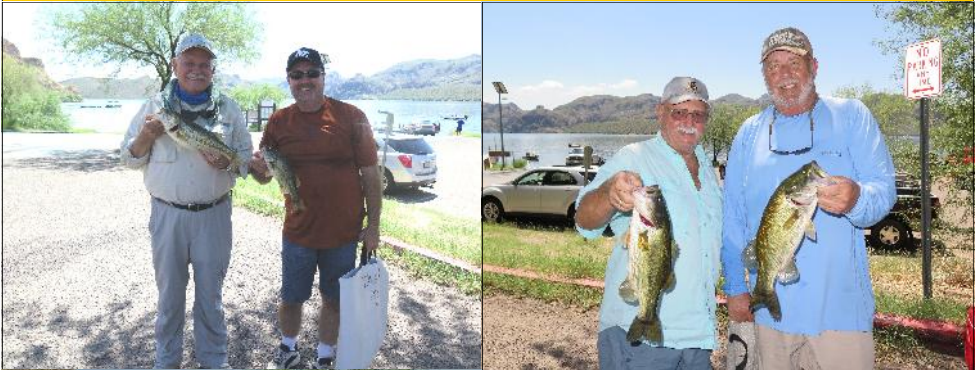
Photo Scrapbook - Lake Saguaro - August 20, 2014

After we weighed in we were in first place but only about half the boats where in. I watched guys bringing in their catch and saw a few bags being held by two guys and thought we were not going to hold on. Well we took first place team and I couldn't believe it. On the way home I thought, "I may never get first place again but at least I can say I won first place team in a Midweek Bass Anglers of Arizona Tournament".