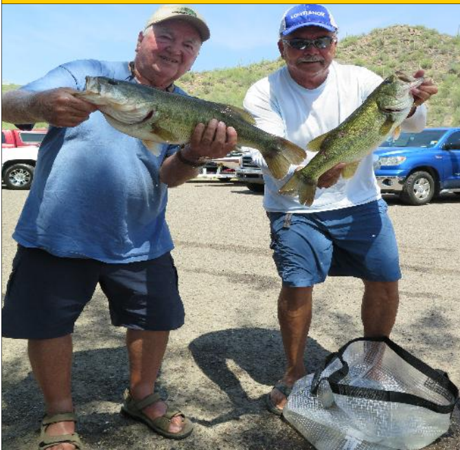
Photo Scrapbook - Lake Saguaro - August 19, 2015