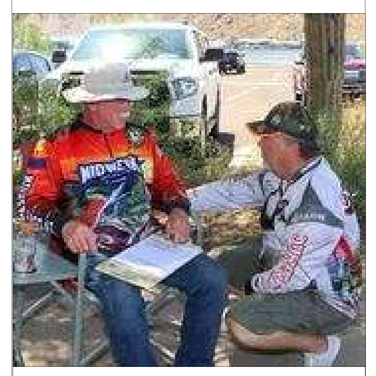
6th Place Tom Savage & Gary Blaustein (not shown)

On tournament day Gary Blaustein and I were able, with divine intervention, to put five fish in the boat. Gary put our first fish in the boat on a small silver Kast Master jig. After what seemed like forever I was finally able to get one on a C-rig, then another on a dropshot. At 10:30 we only had three fish in the boat, and that's when the wind stopped and the water started boiling all around us. I put the trolling motor on high and started chasing fish boils. I finally got close enough to two of them to put our last two fish in the boat. I enjoyed fishing with Gary and I hope to get paired with him again. Congratulations Larry and Rick for a great win on a very tough day.