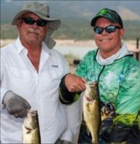
Photo Scrapbook - Lake Bartlett - August 18, 2021