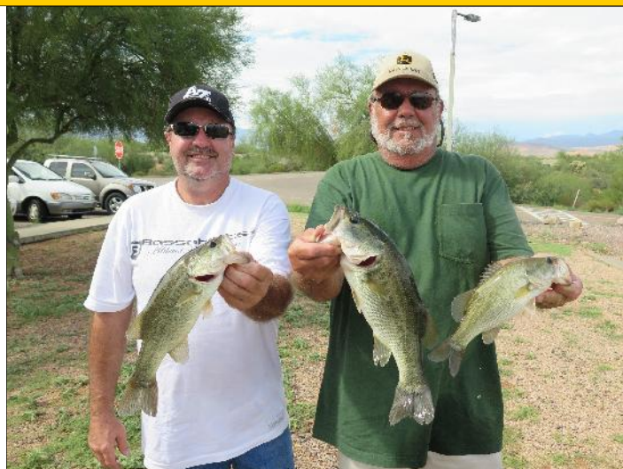
SOME OF THE LITTLE ONES