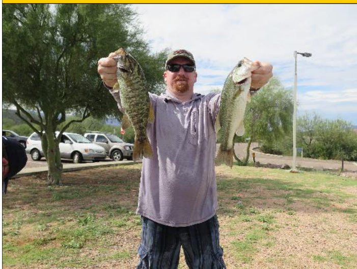
WHO SAYS THERE ARE NO SMALLIES IN ROOSEVELT