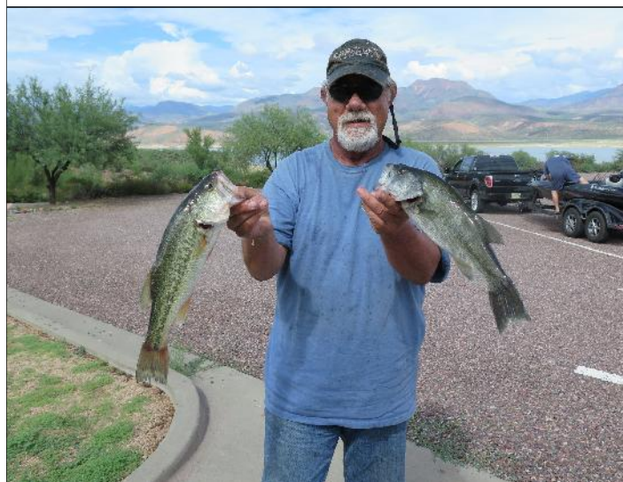
HOW SWEET IT IS!