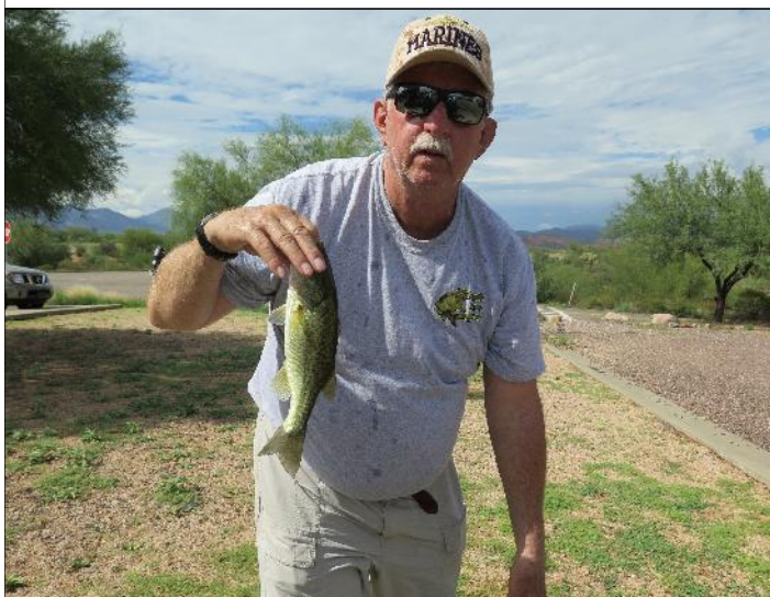
AND THIS WAS MY BIG ONE!