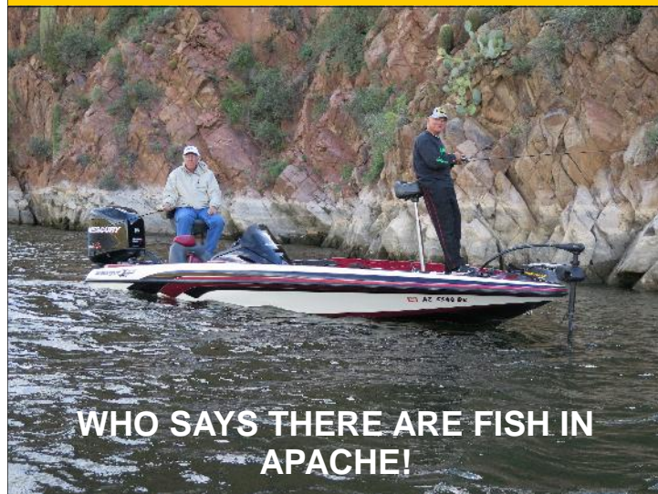
Photo Scrapbook - Lake Apache - October 15, 2014

So my point is this, these dash passes rely largely upon an honor system, and the monies derived from the passes are used to maintain and improve our facilities so that we can continue to enjoy them. So when we don't pay the appropriate fee, in reality we are only hurting ourselves. So even if you have forgotten to scratch that pass, throw it away for after all, it is not an unlimited pass.