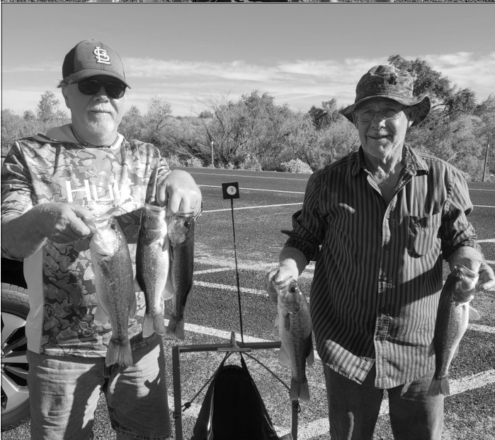
Finally found out why the fish weren't biting...