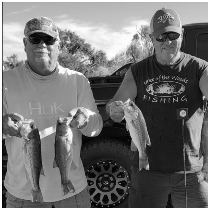
5th Place - Brewer & Hayes

Taking home 5th Place , Team Brewer & Hayes weighed five fish for a total weight of 7.68 pounds.