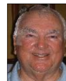
Treasure Chest By John Milkint. Treasurer

Forty men fished 8 hours each, bringing 82 keeper bass to the scales for a total weight of 128.09 pounds with a 3.20 pound average total catch per fisherman. The average weight of each fish was 1.56 lbs. All fish were released back into the lake after weigh-in to fight again another day.