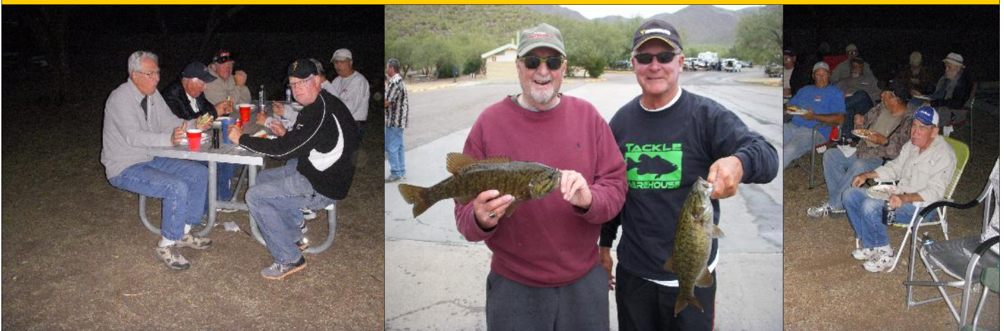
Photo Scrapbook Lake Apache November 20, 2013