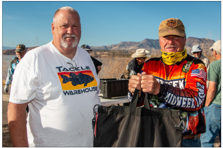
Photo Scrapbook - Lake Roosevelt- October 16, 2019

year, and hope to start the next year as we finished off. Special thanks to all the volunteers at the weigh-in that made this year a success! I will be looking for volunteers for next year so give it some thought because I will be asking for help; I'm sure the main crew will be back, but would like to take on any additional volunteers for the 2022 season. Please let me know if you would like to be involved. It helps makes Midweek Bass the BEST club in the state!