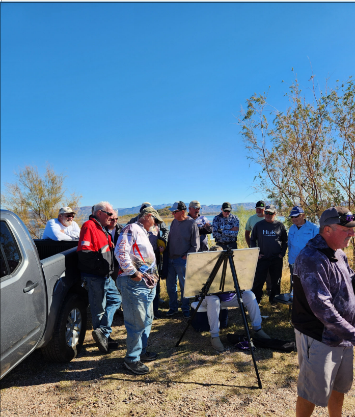
Photo Scrapbook - Lake Roosevelt- November 15-16, 2022