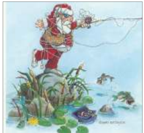
"Dag Nab It"