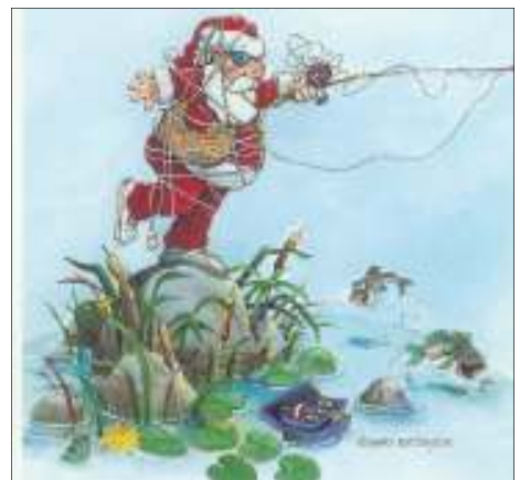
"Dag Nab It"